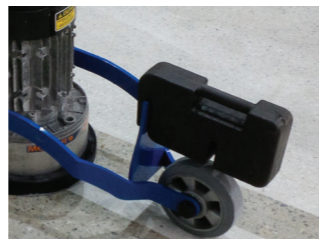
Straight Line Wheel Kit