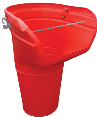
SIDE ENTRY CHUTE