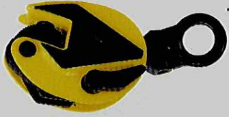
UNIVERSAL PLATE CLAMP MODEL UPC-0.5, UPC-1, UPC-2 & UPC-3