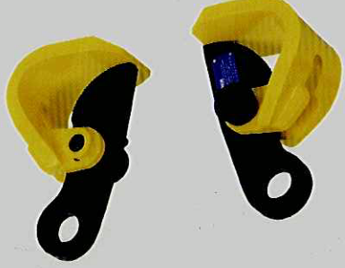
HORIZONTAL PLATE CLAMP MODEL HPC-1.5, HPC-3 & HPC-5