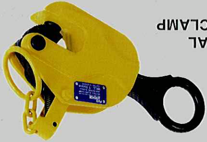
VERTICAL PLATE CLAMP MODEL VPC-1, VPC-2, VPC-3 & VPC-5